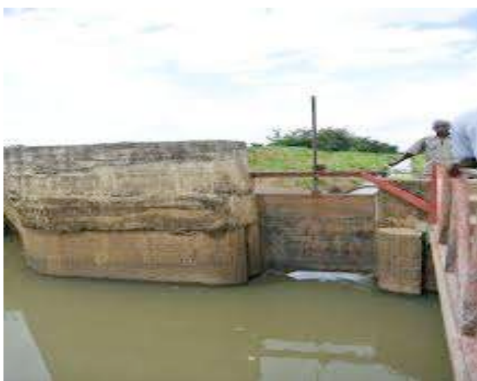
Figure 6: Conversion structure restricting ownership and usage of water resources

Although conversion to cash agriculture may yield a great amount in the short term, such production tends to be restricted to one or few investors, while reducing or eliminating the various type of production which previously went to many individuals in the community.