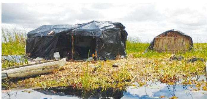
Figure 5: Temporal fishing village on the Kafue Flats

When people come into increased contact with static and unpurified water, as in rice-growing or many other farming practices, an increase in the incidence of bilharzia infections can be expected. This would have a grossly debilitating effect on the community using the wetland calling for unnecessarily heavy investment in health facilities that would have otherwise been avoided.