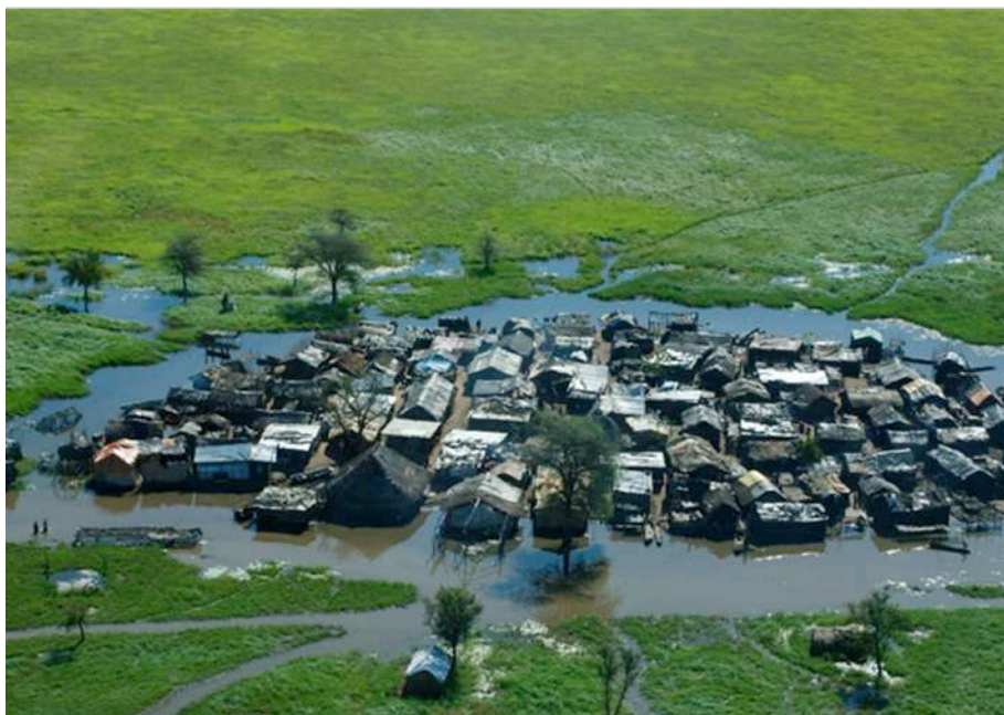
Figure 4: Permanent settlement and fishing village on the Kafue Flats