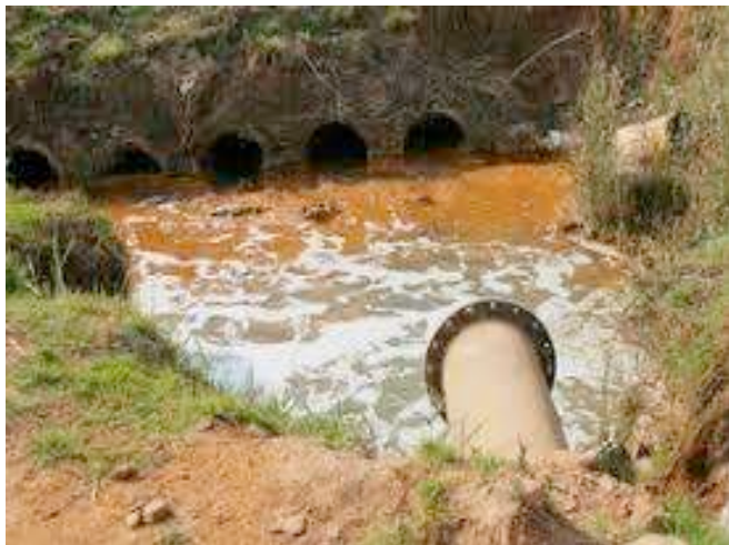
Figure 7: Draining of water from wetlands for mining and release of mining waste into the wetlands

Mining activities in many wetland areas all pose great threats to the health of wetlands, for example, draining of water from wetlands for mining and release of mining waste into the wetlands. Mining also leads to destruction of wetlands, loss of wildlife habitat and habitat destruction.