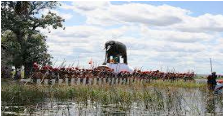
Figure 2: The Nalikwanda boat used during the Kuomboka Ceremony of the Lozi People of Western Zambia