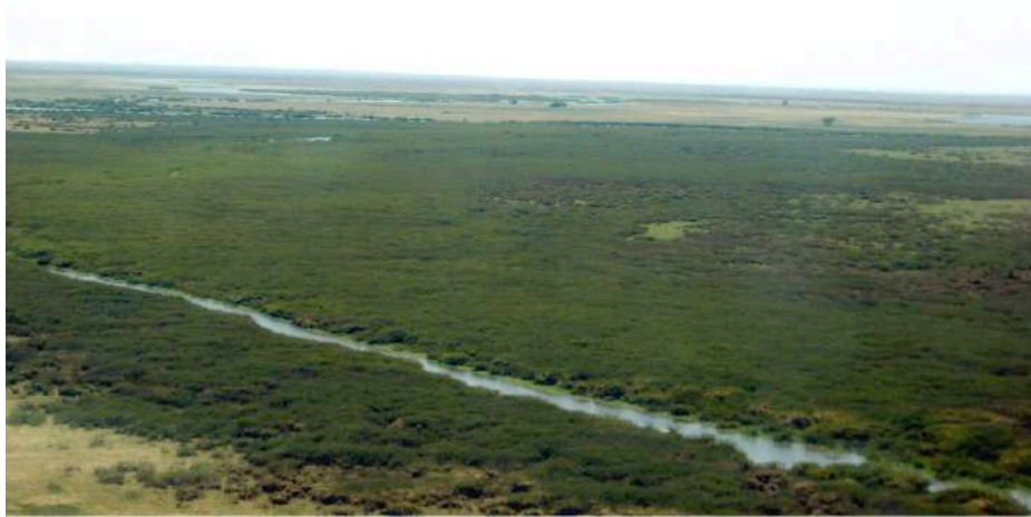
Figure 3: Large areas of grassland invaded by Mimosa pigra on the Kafue Flats

native fish stock is compromised by these invasive species. The obscure snakehead ( Parachanna obscura ) is a freshwater fish native to western central Africa and it is invasive in Mweru-Luapula system. This predatory species fish may compete with native species for food and habitat. If left uncontrolled, this invasive species is likely to expand its range and could permanently alter the balance of aquatic ecosystems throughout Mweru-Luapula.